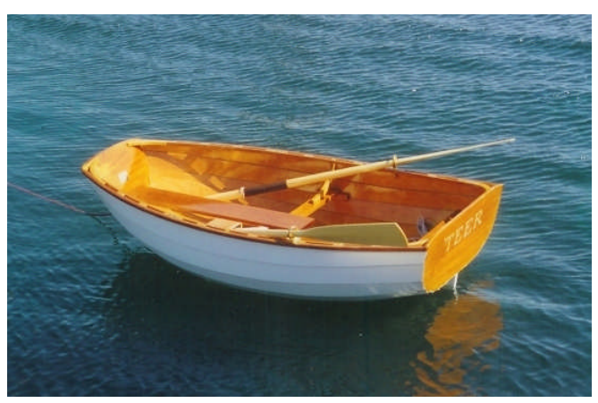
...and 'TEER complete

As the years went by I was drawn into the history of Marionette's design. She was designed and built in the late 1950s transition period from wood to fiberglass - she has