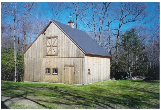
She liked it!!!!