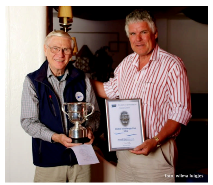
Marionette's racing has been especially rewarding

Marionette's racing has been especially rewarding. In 2017 I was 'dragged' to Lagos, Portugal to accept the Sparkman & Stephens award for the best performance by a S&S designed yacht in the prior year. It was given based on her racing in the Spring Off Soundings regatta for the best corrected time in the race around Block Island - 112 boats racing.